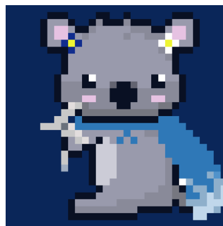
Years 9/10 Kuspreet Kaur