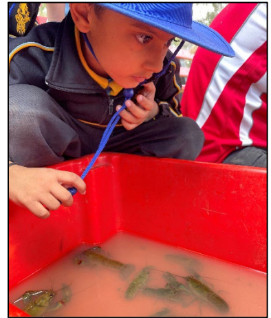
Prep Woodlea Team

The Woodlea Preps embarked on their Prep Day Camp at Lady Northcote and had a fantastic experience engaging in a variety of activities. Students had the chance to try their hand at archery; using their bows and arrows to target with precision. They constructed shelters from sticks, logs and leaves; gaining an understanding of the significance of providing cover. The students also took part in yabbying, using their string on a reel to lower into the lake and employing a net to capture yabbies. Our most successful group managed to secure an impressive haul of 24 yabbies. To conclude the day, they had a go at canoeing; learning the art of scooping water to navigate in a specific direction. The Preps enjoyed a splendid day of team-building, resilience-building and thriving in an outdoor environment. We express our gratitude to Ms McMahon for arranging a fantastic day for our Preps to enjoy before they embark on their journey into Year One.