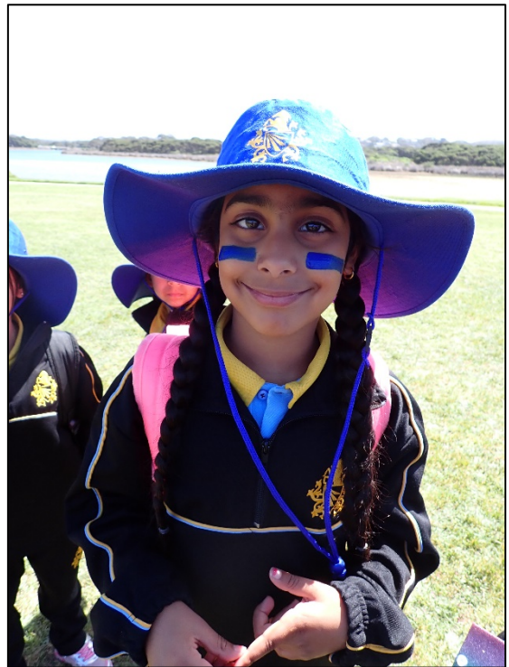
Woodlea Year 1 Team

We would like to extend our heartfelt thanks to all the teachers, camp staff, YMCA staff, parents and leaders who made this day possible. Your dedication and support ensured that our Year One students had an extraordinary day!