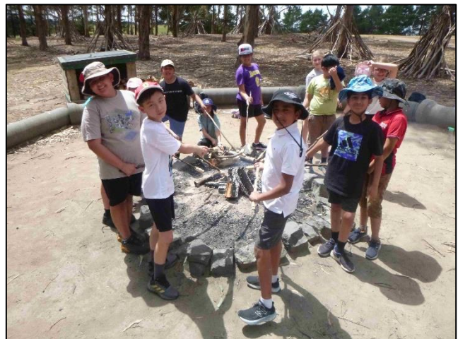
Year 4 Maddingley Team