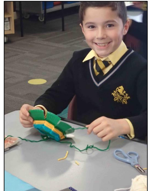
Woodlea Year 2 Team

While studying the technology of communication, discussions were had about how sound is transmitted, how people used to communicate in the past and they were introduced to Alexander Graham Bell – the inventor of the first telephone. Students were shown the history and development of the telephone and how it got to be what it is today, and then participated in creating their own telephone using paper cups.