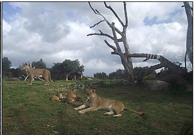
Maddingley Year 2 Team