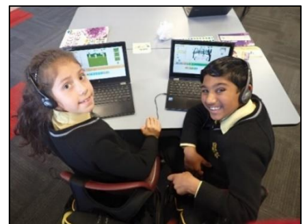
Year 3 IT team

They are excited for their 'coding challenge' each week and look forward to a term full of typing and coding.