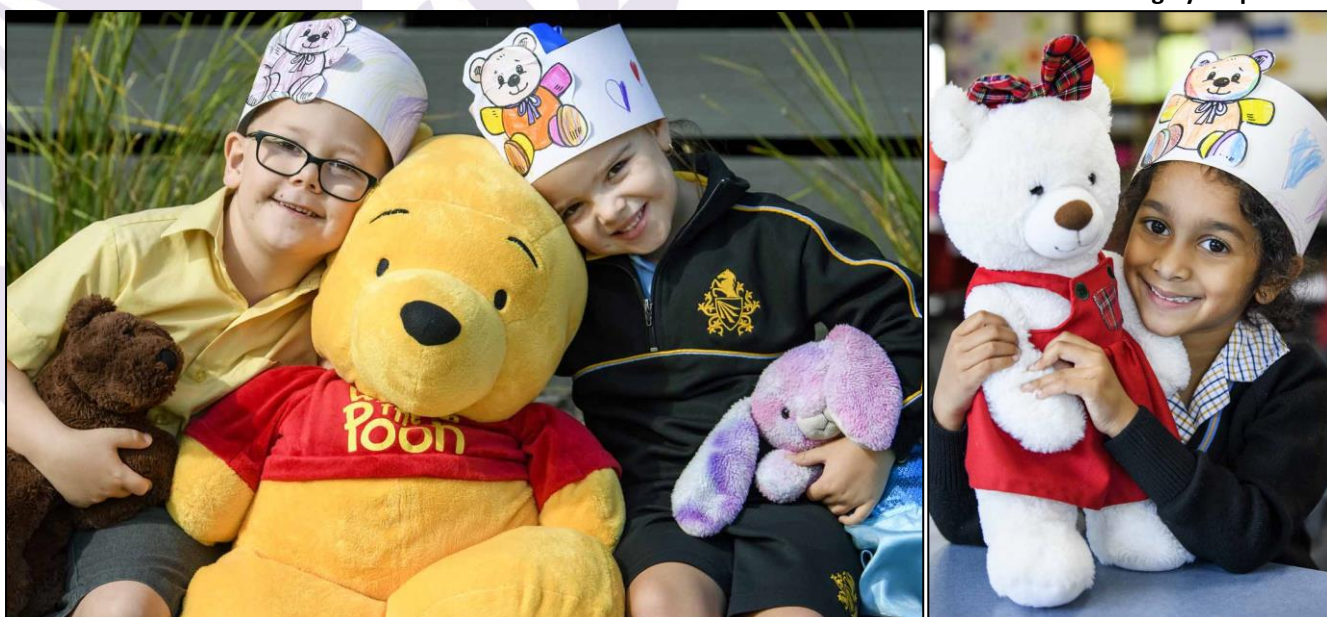
Maddingley Prep Team