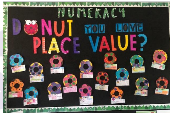
Prep Team Woodlea

This week the Preps have been learning about Place Value and have made some delicious donuts to display in our classrooms. They have been using MAB blocks to learn about ones, tens and hundreds, and this activity required them to make the number they were given in MAB sprinkles! Some even had the challenge of showing their number in expanded notation and written form!