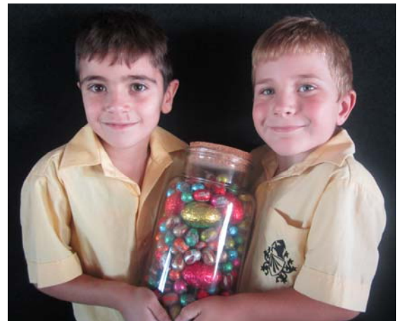
Thank you for your support to date.